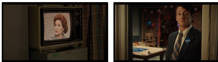
Figure 6: Bryant on TV (00:35:26 & 00:35:30)

perspective, they are set into the context of the life-threatening struggle the LGBTQIAN+ characters lead for their equality. Not only does this enhance a gay sensibility that the film seeks to convey, but also marks another offer to identify with Milk by suggesting his motives for fighting back Bryant's and Brigg's political campaign against homosexuals. Interestingly, despite following a clear good-versus-evil scheme that is innate to Hollywood films, directing the gaze towards the vindicators of the heteronormative system reverses the long tradition of the gay villain trope in cinema (cf. Russo 122). Questioning homophobic viewing habits, this gaze can hence be described as queer.