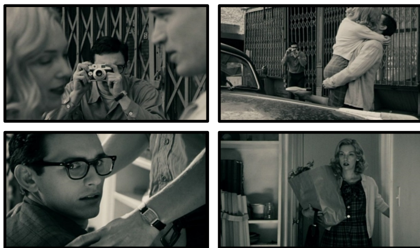
Figure 2: Hetero- vs. homosexual love (f.l.t.r.: 00:28:59, 00:29:32, 00:30:58, 00:30:59)