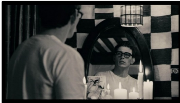
Figure 1: Looking into the mirror (01:11:56)

else is different and why I am different” (01:13:37-01:14:04). The alienation provided him with a perception of the world that seems to match the ‘gay sensibility,’ “coloured, shaped, directed and defined by gayness” (Babuscio 40).