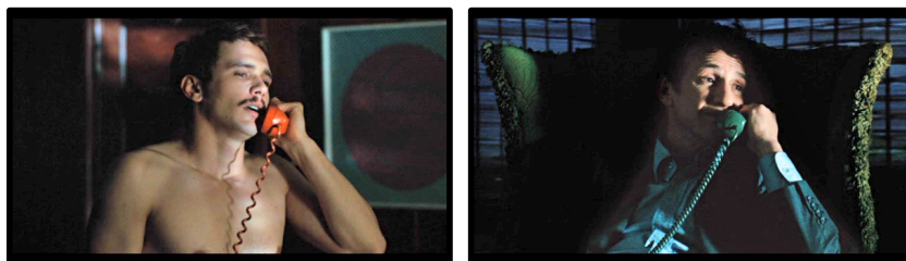
Figure 7: Last phone call (f.l.t.r.: 01:52:12 & 01:53:08)