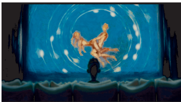
Figure 3: Heterosex in cinema (00:19:16)

these scenes receive a subversive efficacy, which is why the gaze established in these scenes can be described as queer.