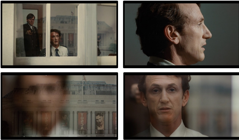
Figure 10: Milk's assassination (f.l.t.r. 01:51:07, 01:51:14, 01:51:20, 01:51:34)