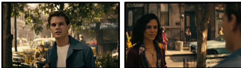
Figure 5: Danny vs. Ray (00:06:34 & 00:05:53)

accepts to dance with Trevor, foreshadowing that Danny will leave the gang of street youths for finding more conventionally 'true' love with Trevor.