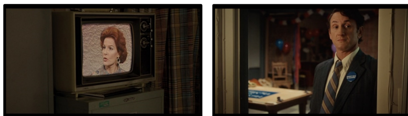
Figure 6: Bryant on TV (00:35:26 & 00:35:30)

perspective, they are set into the context of the life-threatening struggle the LGBTQIAN+ characters lead for their equality. Not only does this enhance a gay sensibility that the film seeks to convey, but also marks another offer to identify with Milk by suggesting his motives for fighting back Bryant's and Brigg's political campaign against homosexuals. Interestingly, despite following a clear good-versus-evil scheme that is innate to Hollywood films, directing the gaze towards the vindicators of the heteronormative system reverses the long tradition of the gay villain trope in cinema (cf. Russo 122). Questioning homophobic viewing habits, this gaze can hence be described as queer.