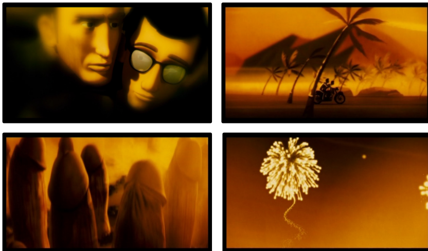
Figure 4: Homosexual intercourse (f.l.t.r.: 00:14:57, 00:15:08, 00:15:18, 00:15:19)

can only be described as a typical male gaze. Thus, these depictions of sexual intercourse in the film enforce rather than question heteronormative structures, eventually creating a homonormative aesthetic.