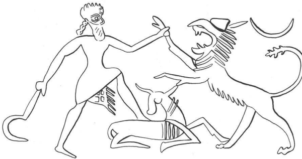
Illustration: On this Neo-Assyrian scroll seal from the 9th-7th century BC, a man presents his dominion over the earth through his stamped foot on the caprid and simultaneously defending it from the lion (taken from: Jan Dietrich 2017, fig. 9). Keel and Schroer comment on the illustration thus: “Having under foot” or ‘treading’ does not necessarily mean brutal, certainly not arbitrary submission, but can also imply the protection of the weaker from the stronger.” (Othmar Keel/ Silvia Schroer 2002, 181 fig. 144)

reverence. The killing of humans remains strictly forbidden, but the Bible obviously reckons with violations of this commandment. Thus, the Noahide Covenant is an agreement that reckons with man's sinfulness and violence and tries to limit it as much as possible—for the protection of people and animals. For never again, God promises, shall there be a flood that destroys everything (Gen 9:11).