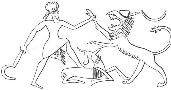
Illustration: On this Neo-Assyrian scroll seal from the 9th-7th century BC, a man presents his dominion over the earth through his stamped foot on the caprid and simultaneously defending it from the lion (taken from: Jan Dietrich 2017, fig. 9). Keel and Schroer comment on the illustration thus: “Having under foot’ or ‘treading’ does not necessarily mean brutal, certainly not arbitrary submission, but can also imply the protection of the weaker from the stronger.” (Othmar Keel/ Silvia Schroer 2002, 181 fig. 144)

reverence. The killing of humans remains strictly forbidden, but the Bible obviously reckons with violations of this commandment. Thus, the Noahide Covenant is an agreement that reckons with man’s sinfulness and violence and tries to limit it as much as possible—for the protection of people and animals. For never again, God promises, shall there be a flood that destroys everything (Gen 9:11).