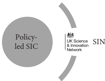
Figure 3 Policy-Led SIC 64