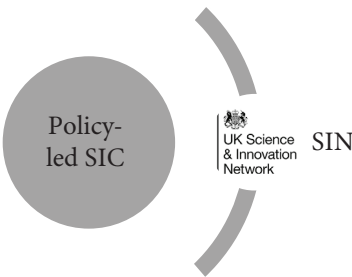
Figure 3 Policy-Led SIC 64