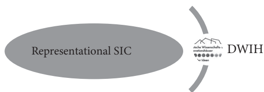
Figure 2 Representational SIC