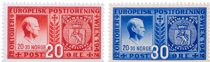
Figure 4: Stamps Issued by the Norwegian Postal Administration Commemorating the European Postal Congress of 1942 in Vienna in Red and Blue.

planned, but due to destruction, the number of stamps brought into distribution was lower, namely 1.9 million and 1.1 million. 850 The sale of the stamps ended on 1 January 1943, 851 and in 1944, the decision was made to destroy the rest of the stamps, which had not been sold. 852