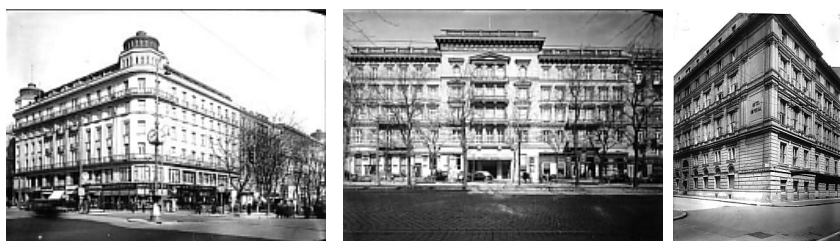
Figure 2: The Congress Hotels; from left to right: Hotel Bristol, the Grand Hotel and Hotel Imperial. 679

The delegates were accommodated in Hotel Bristol, the Grand Hotel and Hotel Imperial, which are all next to or opposite each other on the same street in Vienna, Kärntner Ring (Fig. 2). They were also close to the congress venue. The Swiss delegate, Ernest Bonjour, noted that being hosted in the best hotels in Vienna contributed to making the stay pleasant. 678