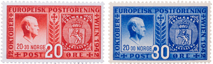
Figure 4: Stamps Issued by the Norwegian Postal Administration Commemorating the European Postal Congress of 1942 in Vienna in Red and Blue, © Posten Norge.

planned, but due to destruction, the number of stamps brought into distribution was lower, namely 1.9 million and 1.1 million. 850 The sale of the stamps ended on 1 January 1943, 851 and in 1944, the decision was made to destroy the rest of the stamps, which had not been sold. 852