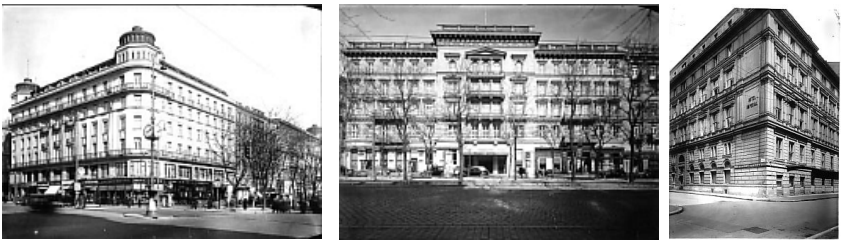
Figure 2: The Congress Hotels; from left to right: Hotel Bristol, the Grand Hotel and Hotel Imperial. 679

The delegates were accommodated in Hotel Bristol, the Grand Hotel and Hotel Imperial, which are all next to or opposite each other on the same street in Vienna, Kärntner Ring (Fig. 2). They were also close to the congress venue. The Swiss delegate, Ernest Bonjour, noted that being hosted in the best hotels in Vienna contributed to making the stay pleasant. 678