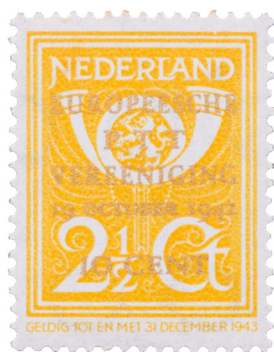
Figure 5: Stamp issued by the Dutch Postal Administration on the Occasion of the European Postal Congress of 1942 in Vienna.

An overprint reading ‘European PTT union, 19 October 1942, 10 cents’ connected the stamp to the congress. 857 The reuse of the motif might have been due to financial issues. A new motif would have meant paying an artist. In addition, the old motif contained the face value of the stamp (2.5 cents), which was overprinted by the new face value, 10 cents. This suggests that finding a motif for this stamp did not take as long as it did in Germany, for example. The focus was on postal relations; no ideological symbols can be found. There were slightly fewer than 7.1 million copies, which represented about 1% of the special stamps issued that year. Thus, the stamp could not have been very visible to the public.