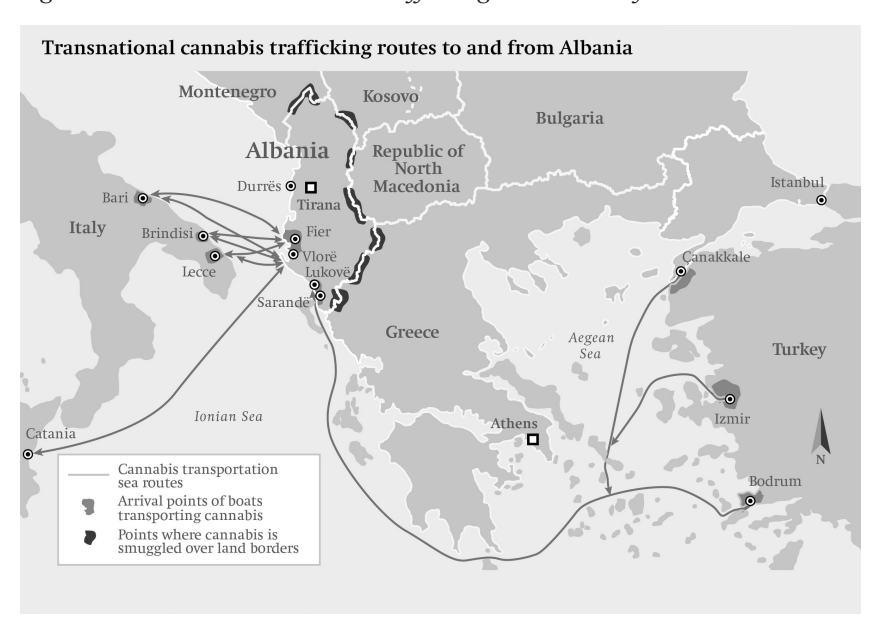
Figure 1: Transnational cannabis trafficking routes to and from Albania

These criminal organisations were not only able to create large networks within Albania but soon started to do so throughout the European continent. Their experience in trafficking cannabis and heroin in Western Europe and the networks of distribution that they were able to create opened the door for their involvement in the lucrative cocaine market. Creating direct connections with the criminal groups in Latin America, these organisations were soon able to transport tonnes of cocaine to some of the main ports in EU countries and also take care of its distribution in the streets of Europe's largest cities. Towards the end of the first decade of the 21st century, cannabis became merely one of the illicit commodities that they had a grip on (Kemp 2020: 31). They were also able to launder money generated from the cultivation and trafficking of drugs, mainly in the construction boom that swept Albania after the fall of communism (Reitano and Amerhauser 2020: 27).