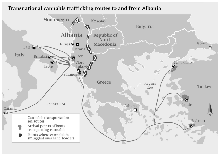
Figure 1: Transnational cannabis trafficking routes to and from Albania

These criminal organisations were not only able to create large networks within Albania but soon started to do so throughout the European continent. Their experience in trafficking cannabis and heroin in Western Europe and the networks of distribution that they were able to create opened the door for their involvement in the lucrative cocaine market. Creating direct connections with the criminal groups in Latin America, these organisations were soon able to transport tonnes of cocaine to some of the main ports in EU countries and also take care of its distribution in the streets of Europe’s largest cities. Towards the end of the first decade of the 21st century, cannabis became merely one of the illicit commodities that they had a grip on (Kemp 2020: 31). They were also able to launder money generated from the cultivation and trafficking of drugs, mainly in the construction boom that swept Albania after the fall of communism (Reitano and Amerhauser 2020: 27).