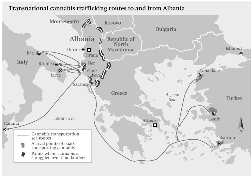
Figure 1: Transnational cannabis trafficking routes to and from Albania

These criminal organisations were not only able to create large networks within Albania but soon started to do so throughout the European continent. Their experience in trafficking cannabis and heroin in Western Europe and the networks of distribution that they were able to create opened the door for their involvement in the lucrative cocaine market. Creating direct connections with the criminal groups in Latin America, these organisations were soon able to transport tonnes of cocaine to some of the main ports in EU countries and also take care of its distribution in the streets of Europe's largest cities. Towards the end of the first decade of the 21st century, cannabis became merely one of the illicit commodities that they had a grip on (Kemp 2020: 31). They were also able to launder money generated from the cultivation and trafficking of drugs, mainly in the construction boom that swept Albania after the fall of communism (Reitano and Amerhauser 2020: 27).