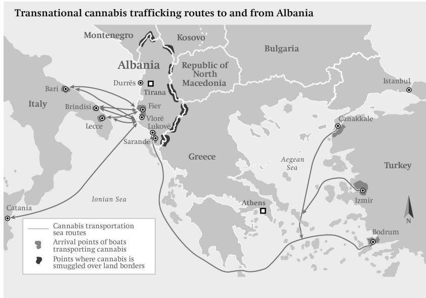
Figure 1: Transnational cannabis trafficking routes to and from Albania

These criminal organisations were not only able to create large networks within Albania but soon started to do so throughout the European continent. Their experience in trafficking cannabis and heroin in Western Europe and the networks of distribution that they were able to create opened the door for their involvement in the lucrative cocaine market. Creating direct connections with the criminal groups in Latin America, these organisations were soon able to transport tonnes of cocaine to some of the main ports in EU countries and also take care of its distribution in the streets of Europe's largest cities. Towards the end of the first decade of the 21st century, cannabis became merely one of the illicit commodities that they had a grip on (Kemp 2020: 31). They were also able to launder money generated from the cultivation and trafficking of drugs, mainly in the construction boom that swept Albania after the fall of communism (Reitano and Amerhauser 2020: 27).