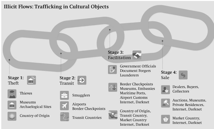
Figure 1: Illicit Flows: Trafficking in Cultural Objects