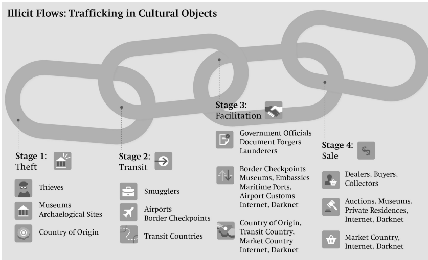
Figure 1: Illicit Flows: Trafficking in Cultural Objects