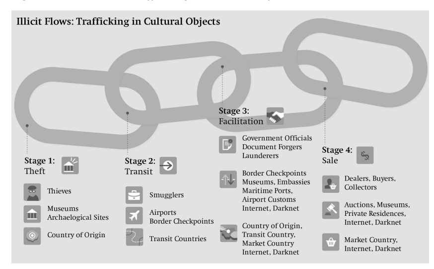
Figure 1: Illicit Flows: Trafficking in Cultural Objects

2.1. Criminal supply chain: from looters in the Global South to Europe's art markets