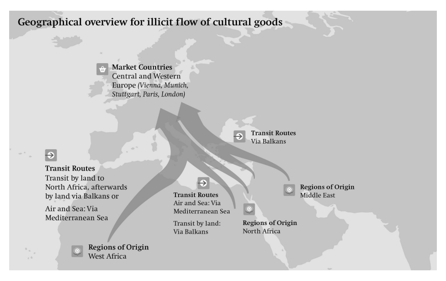
Figure 2: Geographical overview for illicit flow of cultural goods