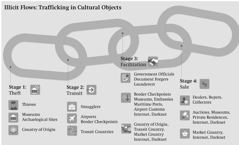
Figure 1: Illicit Flows: Trafficking in Cultural Objects