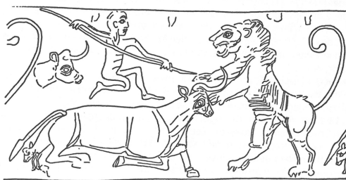
Illustration: On this Early Sumerian scroll seal from c. 3300–2900 BC, a naked man defends a calving cow against a lion while placing his foot on it (taken from: Jan Dietrich 2017, Fig. 1).