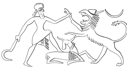
Illustration: On this Neo-Assyrian scroll seal from the 9th–7th century BC, a man presents his dominion over the earth through his stamped foot on a caprid and his simultaneous defence of a lion (taken from: Jan Dietrich 2017, Fig. 9). Keel and Schroer comment on the illustration thus: "Having under foot' or 'treading' does not necessarily mean brutal, certainly not arbitrary submission, but can also imply the protection of the weaker from the stronger." (Othmar Keel/ Silvia Schroer 2002, 181, Fig. 144)

The narrative ends in Gen. 1:29–2:3 with the vision of cosmic peace (Karl Löning/ Erich Zenger 1997, 155–162). With a so-called formula of transfer , God, like a lord to his vassals, gives all living beings the earth as a house and the plants as food. Every living being has its place and its food. In this context, the vegetarian nourishment of all living beings is a sign of the fullness of life: "That the most precious good in the house of life of creation is the happy life of all living beings unfolds [in] Gen. 1:29f with an image of peace that we must meditate on and concretise especially today as a paradigm critical of progress [... ] The central point of this utopia is a coexistence of all living beings without violence." (Erich Zenger 1989, 142)