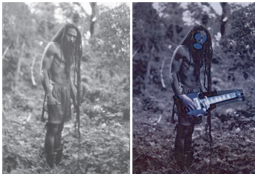
Figs. 5 and 6: Left: Patrick Cariou, photograph from “Yes, rasta” (2000); Right: Prince, work from “Canal Zone” (2008)

renowned 20 th -century artist, but also prevents the artist from publicly conveying his artistic message.