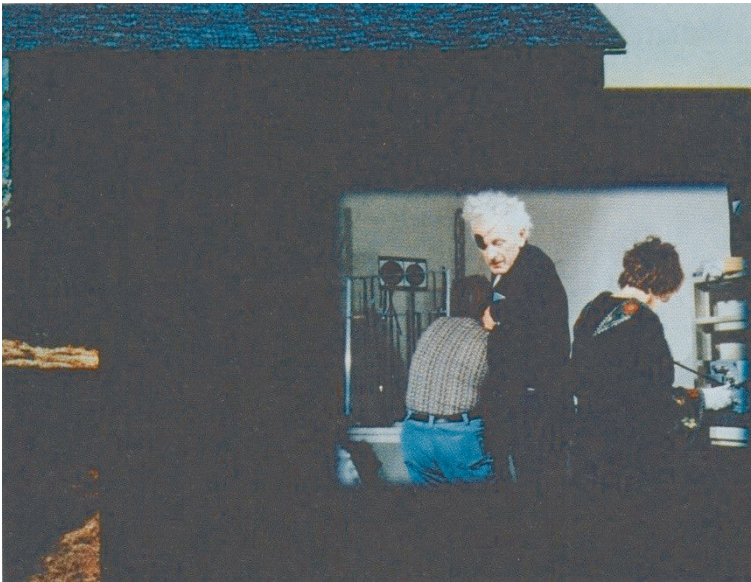
Figs. 1 and 2: Comparison of the test results of workflow for the restoration of the film We Can't Go Home Again (1973), Nicholas Ray