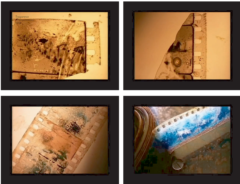
Figs. 4 to 7: Stills of Trasparenze (1998), Gianikian and Ricci Lucchi

a reflection on the decomposition of nitrate film, the erasure of images, and the chemical and historical amnesia of the archive. About ten years earlier, in 1986, this film material and the images inscribed in it had been used by Gianikian and Ricci Lucchi to make the war part of their film Dal Polo all'Equatore . 35 In the process of decomposition, the film, which could no longer be unwound, was transformed into a single block. The torn support, the fluorescence and the faded colours remain transparent until the images shot by Comerio were completely erased (Figs. 4 to 7).