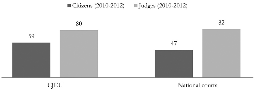
Figure 1: Trust in the CJEU and National courts by citizens and judges (%)

Notes: Citizens data from Eurobarometers 77.3 – 2012 (CJEU) and 74.2 – 2010 (National judicial systems). The values where 1: ‘tend to trust’, and, 2: ‘tend not to trust the CJEU’. In the case of judges, the data refers to their trust in their domestic highest courts: The German, Polish and Spanish Constitutional Courts and the Dutch Supreme Court. The variable measures the intensity of trust in the both courts, using a five-point scale variable: 0: do not trust, 1: hardly trust, 2: neither trust nor distrust, 3: trust, 4: trust very much. Trust is represented by taken values from 3 and 4.