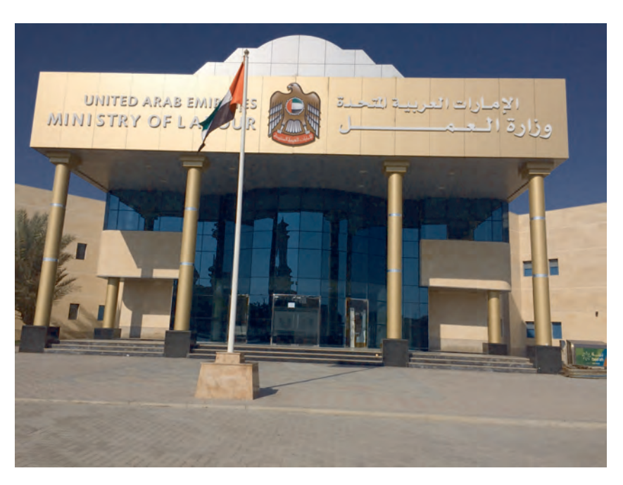
Fig. 2: Ministry of Labour Office, Sharjah city, UEA, 2 January 2016

environment, and their royal connection – the sheikh himself – would ensure that they had financial support or access to jobs.