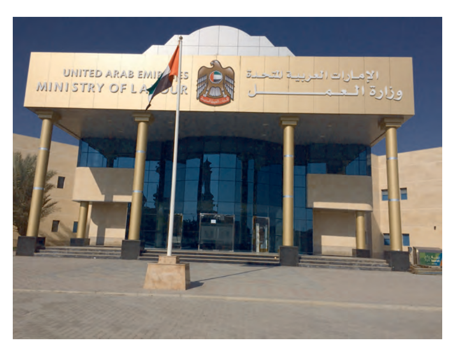
Fig. 2: Ministry of Labour Office, Sharjah city, UEA, 2 January 2016

environment, and their royal connection – the sheikh himself – would ensure that they had financial support or access to jobs.