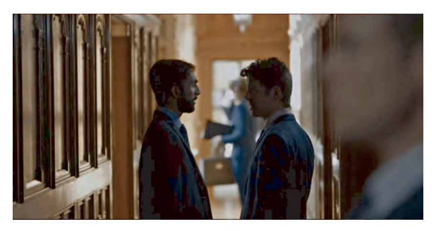
Fig. 3: Still from Bodyguard (2018, S1.E3; 27:21)

Rob Macdonald: "Your job is to be visible beside the Home Secretary. The demographic most vulnerable to our counterterrorism policy is ... Doesn't take a genius to join the dots". (S1.E3, 27:14–27:24) (fig 3.)