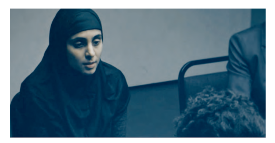
Fig. 2: Still from Bodyguard (2018, S1.E6; 1:08:08)