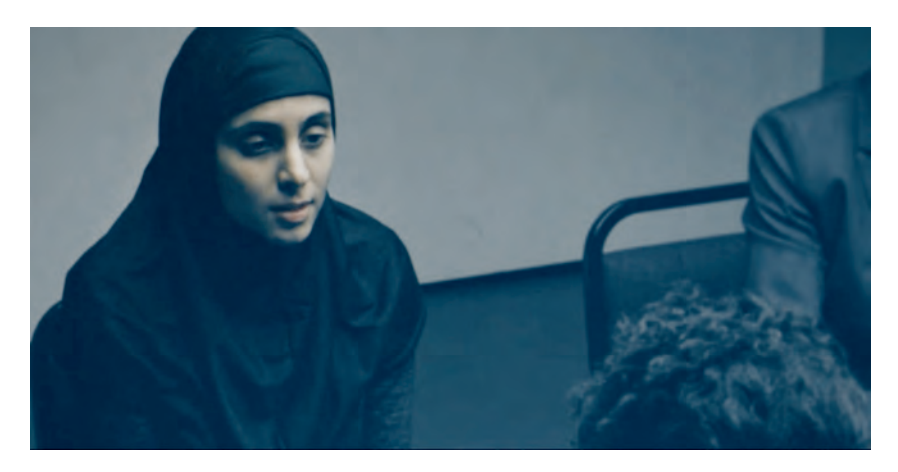
Fig. 2: Still from Bodyguard (2018, S1.E6; 1:08:08)