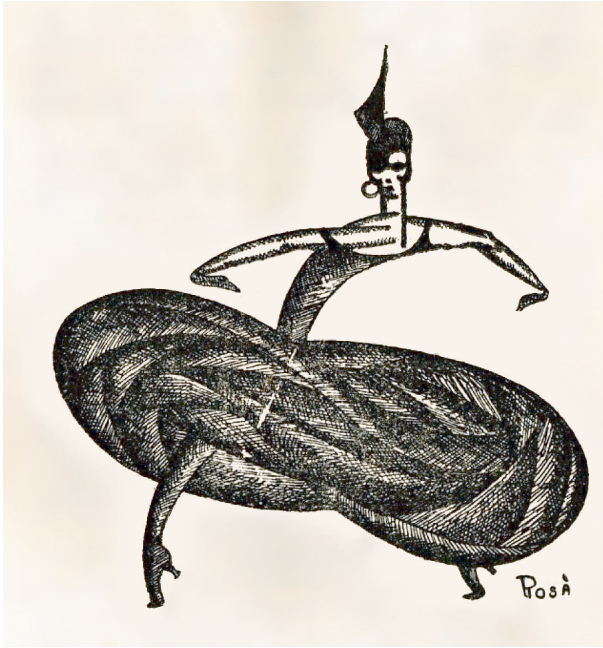
Figure 3. Edyth von Haynau (?): Possibly a preliminary drawing of the fifth illustration in Carli, Mario: Notti filtrate .