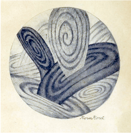
Figure 5. Edyth von Haynau: “Mona Vanna”