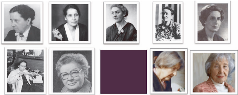
Figure 2: The female Scientific Members of the Max Planck Society, 1948–1998 24