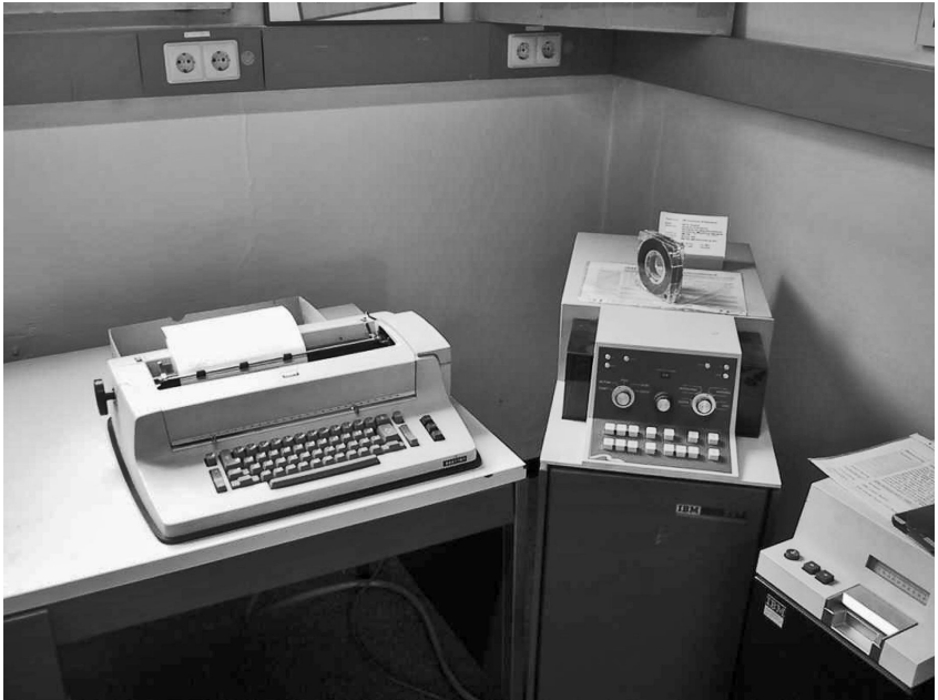
Figure 3: The IBM MT/ST word processor used in the mid-1960s at the Max Planck Institute for Human Development in Berlin. 74

The “buzz word“ for this year's show was “word processing,“ or the use of electronic equipment, such as typewriters; procedures, and trained personnel to Maximize office efficiency. At the I.B.M. exhibition a girl typed on an electronic typewriter. The copy was received on a magnetic tape cassette which accepted corrections, deletions and additions and then produced a perfect letter for the boss's signature. The perfect letter could then be sent over telephone lines to other offices around the country, or the typewriter could also be used as an input device for computers. 73