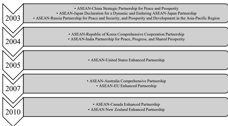
Figure 1: List of ASEAN Dialogue Partnerships

In addition to the European Union, by 1977, the ASEAN has already dialogue partnerships with the likes of Japan, Australia, New Zealand, and ASEAN foreign ministers regularly met with their counterparts from other countries, otherwise known as the ASEAN’s “official dialogue partners” in Post-Ministerial Conferences (“PMC”). 457 In such official dialogue setting, one member state shall act as a coordinator for a dialogue partner in a three-year rotation. 458 Over the years, these dialogue partnerships were translated into more formal partnerships as illustrated by Figure 1 below provides the formal dialogue partnerships forged and the respective dates of signing: