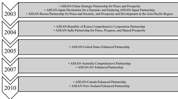
Figure 1: List of ASEAN Dialogue Partnerships

In addition to the European Union, by 1977, the ASEAN has already dialogue partnerships with the likes of Japan, Australia, New Zealand, and ASEAN foreign ministers regularly met with their counterparts from other countries, otherwise known as the ASEAN’s “official dialogue partners” in Post-Ministerial Conferences (“PMC”). 457 In such official dialogue setting, one member state shall act as a coordinator for a dialogue partner in a three-year rotation. 458 Over the years, these dialogue partnerships were translated into more formal partnerships as illustrated by Figure 1 below provides the formal dialogue partnerships forged and the respective dates of signing: