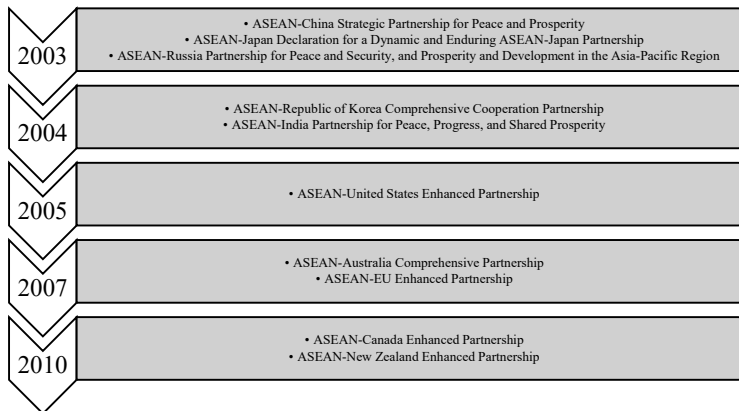
Figure 1: List of ASEAN Dialogue Partnerships

In addition to the European Union, by 1977, the ASEAN has already dialogue partnerships with the likes of Japan, Australia, New Zealand, and ASEAN foreign ministers regularly met with their counterparts from other countries, otherwise known as the ASEAN’s “official dialogue partners” in Post-Ministerial Conferences (“PMC”). 457 In such official dialogue setting, one member state shall act as a coordinator for a dialogue partner in a three-year rotation. 458 Over the years, these dialogue partnerships were translated into more formal partnerships as illustrated by Figure 1 below provides the formal dialogue partnerships forged and the respective dates of signing: