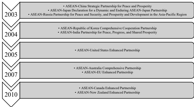
Figure 1: List of ASEAN Dialogue Partnerships

In addition to the European Union, by 1977, the ASEAN has already dialogue partnerships with the likes of Japan, Australia, New Zealand, and ASEAN foreign ministers regularly met with their counterparts from other countries, otherwise known as the ASEAN’s “official dialogue partners” in Post-Ministerial Conferences (“PMC”). 457 In such official dialogue setting, one member state shall act as a coordinator for a dialogue partner in a three-year rotation. 458 Over the years, these dialogue partnerships were translated into more formal partnerships as illustrated by Figure 1 below provides the formal dialogue partnerships forged and the respective dates of signing: