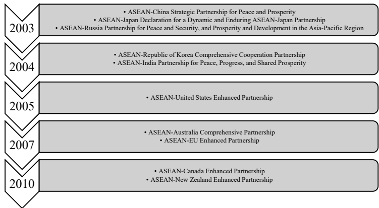
Figure 1: List of ASEAN Dialogue Partnerships

In addition to the European Union, by 1977, the ASEAN has already dialogue partnerships with the likes of Japan, Australia, New Zealand, and ASEAN foreign ministers regularly met with their counterparts from other countries, otherwise known as the ASEAN’s “official dialogue partners” in Post-Ministerial Conferences (“PMC”). 457 In such official dialogue setting, one member state shall act as a coordinator for a dialogue partner in a three-year rotation. 458 Over the years, these dialogue partnerships were translated into more formal partnerships as illustrated by Figure 1 below provides the formal dialogue partnerships forged and the respective dates of signing: