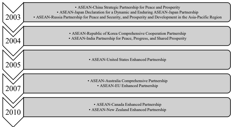
Figure 1: List of ASEAN Dialogue Partnerships

In addition to the European Union, by 1977, the ASEAN has already dialogue partnerships with the likes of Japan, Australia, New Zealand, and ASEAN foreign ministers regularly met with their counterparts from other countries, otherwise known as the ASEAN’s “official dialogue partners” in Post-Ministerial Conferences (“PMC”). 457 In such official dialogue setting, one member state shall act as a coordinator for a dialogue partner in a three-year rotation. 458 Over the years, these dialogue partnerships were translated into more formal partnerships as illustrated by Figure 1 below provides the formal dialogue partnerships forged and the respective dates of signing: