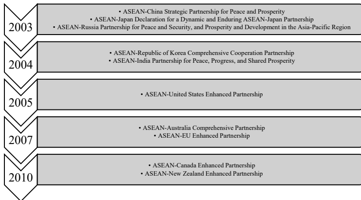
Figure 1: List of ASEAN Dialogue Partnerships

In addition to the European Union, by 1977, the ASEAN has already dialogue partnerships with the likes of Japan, Australia, New Zealand, and ASEAN foreign ministers regularly met with their counterparts from other countries, otherwise known as the ASEAN’s “official dialogue partners” in Post-Ministerial Conferences (“PMC”). 457 In such official dialogue setting, one member state shall act as a coordinator for a dialogue partner in a three-year rotation. 458 Over the years, these dialogue partnerships were translated into more formal partnerships as illustrated by Figure 1 below provides the formal dialogue partnerships forged and the respective dates of signing: