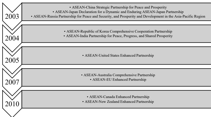
Figure 1: List of ASEAN Dialogue Partnerships

In addition to the European Union, by 1977, the ASEAN has already dialogue partnerships with the likes of Japan, Australia, New Zealand, and ASEAN foreign ministers regularly met with their counterparts from other countries, otherwise known as the ASEAN’s “official dialogue partners” in Post-Ministerial Conferences (“PMC”). 457 In such official dialogue setting, one member state shall act as a coordinator for a dialogue partner in a three-year rotation. 458 Over the years, these dialogue partnerships were translated into more formal partnerships as illustrated by Figure 1 below provides the formal dialogue partnerships forged and the respective dates of signing: