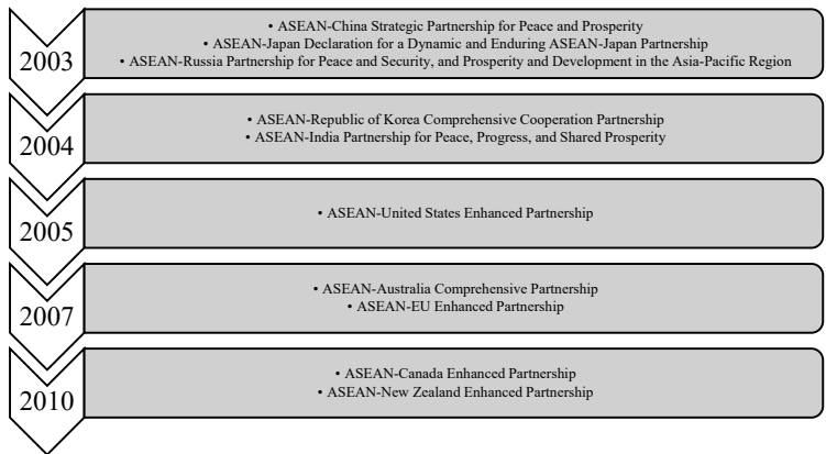
Figure 1: List of ASEAN Dialogue Partnerships

In addition to the European Union, by 1977, the ASEAN has already dialogue partnerships with the likes of Japan, Australia, New Zealand, and ASEAN foreign ministers regularly met with their counterparts from other countries, otherwise known as the ASEAN’s “official dialogue partners” in Post-Ministerial Conferences (“PMC”). 457 In such official dialogue setting, one member state shall act as a coordinator for a dialogue partner in a three-year rotation. 458 Over the years, these dialogue partnerships were translated into more formal partnerships as illustrated by Figure 1 below provides the formal dialogue partnerships forged and the respective dates of signing: