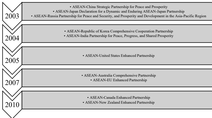
Figure 1: List of ASEAN Dialogue Partnerships

In addition to the European Union, by 1977, the ASEAN has already dialogue partnerships with the likes of Japan, Australia, New Zealand, and ASEAN foreign ministers regularly met with their counterparts from other countries, otherwise known as the ASEAN’s “official dialogue partners” in Post-Ministerial Conferences (“PMC”). 457 In such official dialogue setting, one member state shall act as a coordinator for a dialogue partner in a three-year rotation. 458 Over the years, these dialogue partnerships were translated into more formal partnerships as illustrated by Figure 1 below provides the formal dialogue partnerships forged and the respective dates of signing: