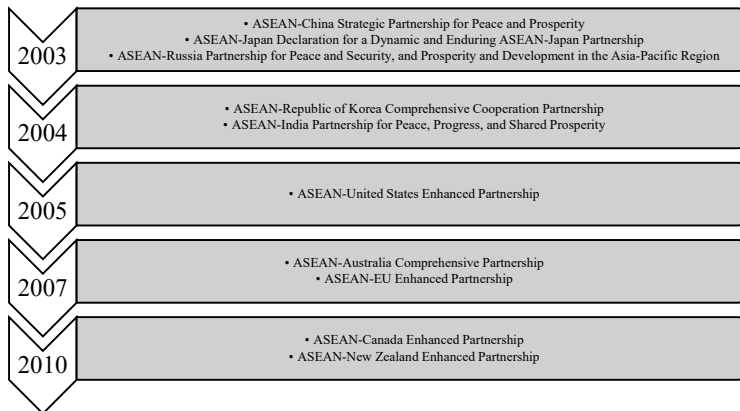
Figure 1: List of ASEAN Dialogue Partnerships

In addition to the European Union, by 1977, the ASEAN has already dialogue partnerships with the likes of Japan, Australia, New Zealand, and ASEAN foreign ministers regularly met with their counterparts from other countries, otherwise known as the ASEAN’s “official dialogue partners” in Post-Ministerial Conferences (“PMC”). 457 In such official dialogue setting, one member state shall act as a coordinator for a dialogue partner in a three-year rotation. 458 Over the years, these dialogue partnerships were translated into more formal partnerships as illustrated by Figure 1 below provides the formal dialogue partnerships forged and the respective dates of signing: