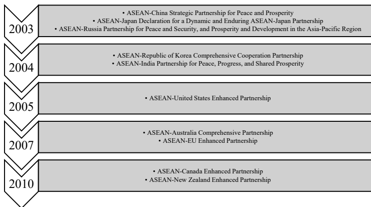
Figure 1: List of ASEAN Dialogue Partnerships

In addition to the European Union, by 1977, the ASEAN has already dialogue partnerships with the likes of Japan, Australia, New Zealand, and ASEAN foreign ministers regularly met with their counterparts from other countries, otherwise known as the ASEAN’s “official dialogue partners” in Post-Ministerial Conferences (“PMC”). 457 In such official dialogue setting, one member state shall act as a coordinator for a dialogue partner in a three-year rotation. 458 Over the years, these dialogue partnerships were translated into more formal partnerships as illustrated by Figure 1 below provides the formal dialogue partnerships forged and the respective dates of signing: