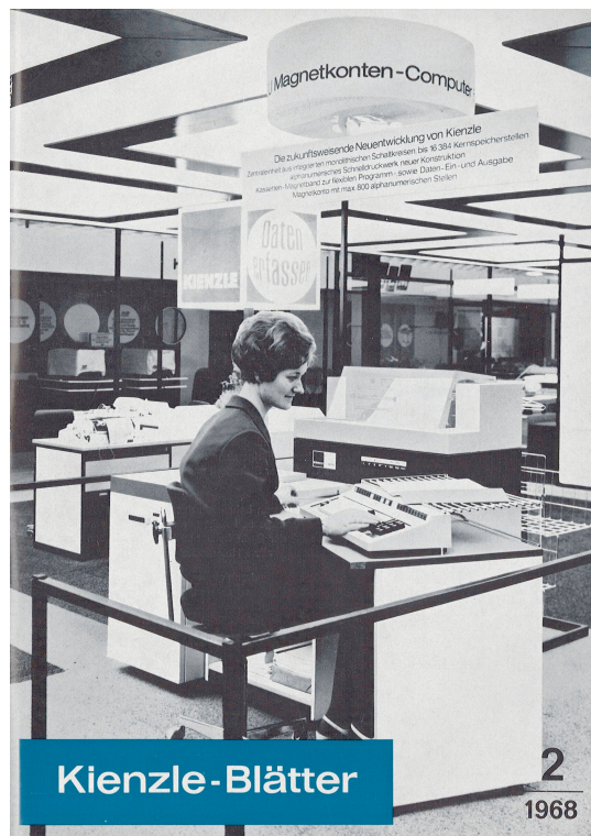
Picture 2: With the Class 6000 magnetic accounting computer, Kienzle achieved a breakthrough in the market for smaller computer systems.

company was somewhat overshadowed by Nixdorf, the new market leader in Germany, it was able to offer attractive solutions for small and medium-sized businesses introducing new all-electronic systems, such as the 800 and 6000 series. The new models made it easier for many customers of previously mechanical business machines to move into electronic data processing. Large numbers of units were quickly sold, especially of the magnetic ledger accounting machines. The customers were industrial and commercial companies, especially banks and financial institutions, which rationalized and automated their administrative and organizational processes with medium data systems. Comparatively, inexpensive computers from Nixdorf and Kienzle also enabled medium-sized companies to enter the world of electronic data processing.