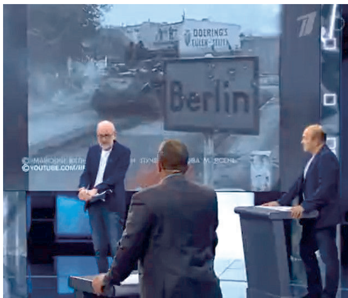
Figure 3: The memory of the victory over the German fascists in World War II is omnipresent on Russian television. 33

The memory of World War II is meant to mobilize for renewed battle, but it also serves to present Russia as a renewed victim of fascism. On the talk show “ Vremya Vspomnit ” (Time to Remember) on Perviy Kanal , Russia’s largest TV channel, the host Aleksandr Gordon showed a video of the 1945 victory celebration in defeated Berlin. “It seemed that they will never forget it,” he says, but then presents Latvia’s reactions to the war in Ukraine, such as classifying Russia as a “state that supports terror”. 34 Latvia’s restrictions on the entry of Russian citizens and the use of the Russian language are also discussed. Gordon sees Russians as victims of a new fascism when he asks: “In the 21st century Russians have taken over the role of Jews, is it so or not?” In the course of the program, Gordon himself answers: “What has