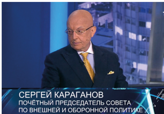
Figure 7: Foreign policy expert Karaganov sees China and Russia as winners in the global power struggle. Screenshot: TV Center. 58

The geopolitical mastermind nurtures imperial self-confidence: “We are a unique empire. That’s what we can offer humanity: true multiculturalism and openness. We are the civilization of civilizations.” 59 Karaganov interprets the Ukraine war as “the last desperate counterattack of the West”, which refuses to give up its global hegemony. Russia’s goal is to break the West’s resistance. This is to be expected in ten to fifteen years, and for that Russia must win the war, the foreign policy expert said. 60