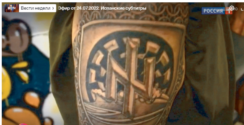
Figure 1: A report on Ukrainian neo-Nazis in the “News of the Week”. Screenshot: Rossia 1 . 20

The fight with Ukrainian fascists is the focus of political broadcasts, like in the mentioned “News of the Week”. Bald-headed, bare-chested men are shown having Nazi symbols such as the “Wolfsangel” tattooed on their skin. Their alleged torture methods are then described in detail. 21