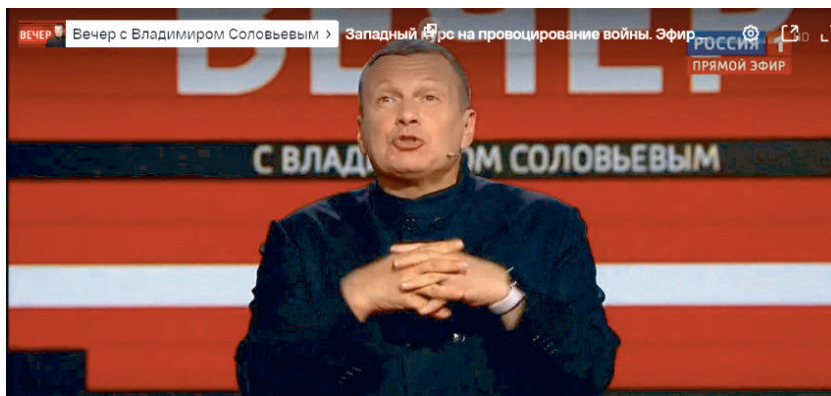
Figure 8: Well-known presenter Vladimir Solovyov mocks energy-saving measures in Germany. Screenshot: Rossia 1 . 69

In the domestic media, propagandists are also convinced that the Germans are harming themselves the most with the sanctions. In the talk show “Evening with Vladimir Solovyov” on Rossia 1 , the well-known presenter Solovyov expressed open joy that Germans were only allowed to heat public buildings up to 19 degrees in winter. “So what, just walk around inside in your coat. Germans will be easily recognized. Let them walk around the apartment in their coats all the time, back and forth [...]” 70