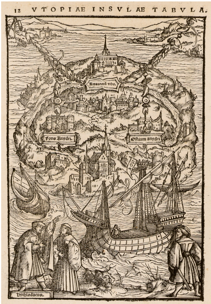
Fig. 2: Map of Utopia by Ambrosius Holbein in the edition of 1518 by Froben in Basel. It is printed on page 16 of the book entitled De optimo reip. statu deque nova insula Utopia libellus vere aureus, nec minus salutaris quam festivus, clarissimi disertissimique viri Thomae Mori inclytae civitatis Londinensis civis & vicecomitis. Epigrammata clarissimi disertissimique viri Thomae Mori, pleraque e Graecis versa. Epigrammata/Des. Erasmi Roterodami. 25