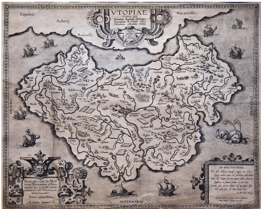
Fig. 3: Abraham Ortelius, Map of Utopia , copper engraving, 380 × 475 mm, 1595, Plantin-Moretus-Museum, Antwerp. The map follows contemporary geographical conventions. 29

him is whether a political state can be Christian and to what extent Christian virtues can be exercised in the world of politics. More's commitment to a res publica christiana , a Christian state, is crucial and underlies his political discourse.