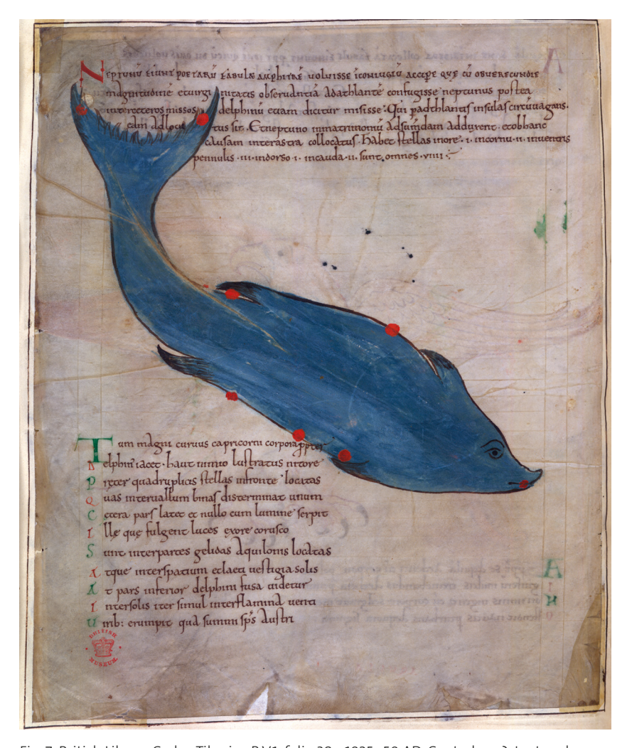
Fig. 7: British Library Codex Tiberius B.V.1, folio 38v, 1025–50 AD, Canterbury?, text and illustration of the constellation Delphinus, from Cicero's Latin translation of Aratus's Phaenomena .

explicitly prefaced, in red ink, with a paragraph that encourages the monastic students to read the text in tandem with the accompanying map of the oecumene contained in this codex, the mappa mundi on folio 56v:<sup>35</sup>