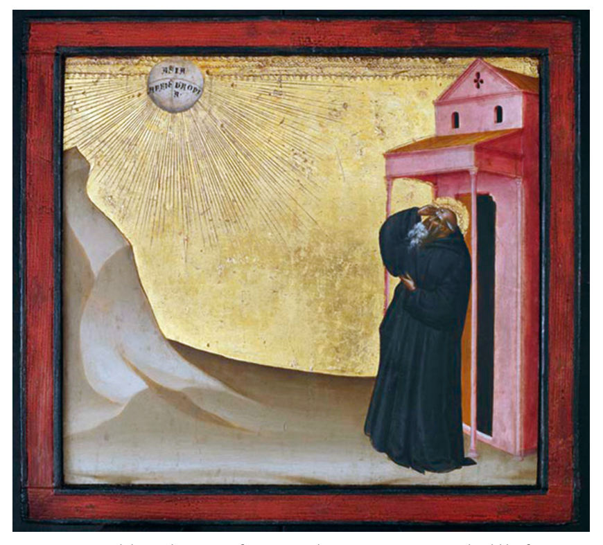
Fig. 8: Giovanni del Biondo, Vision of Saint Benedict , c. 1360, tempera and gold leaf on panel, 35.8 \times 39.3 cm, Benedict's vision of the world depicted as a T-O map, Art Gallery of Ontario, Toronto.<sup>61</sup>

( mundus ), heaven and earth, in the divine light of the Creator, at the height of contemplative ascent (fig. 8). This anagogical layer of meaning of medieval mappae mundi is glimpsed in a variety of medieval texts and images, from the use of a mappa mundi in Beatus's manuscripts to depict John, the seer's vision from the heavenly throne room (Rev 4–5),<sup>62</sup> to Hugh of St Victor's use of mappae mundi as a complex and multifaceted pedagogical tool in the 12th century, notably in his complex visual treatises on the ark of Noah.<sup>63</sup>