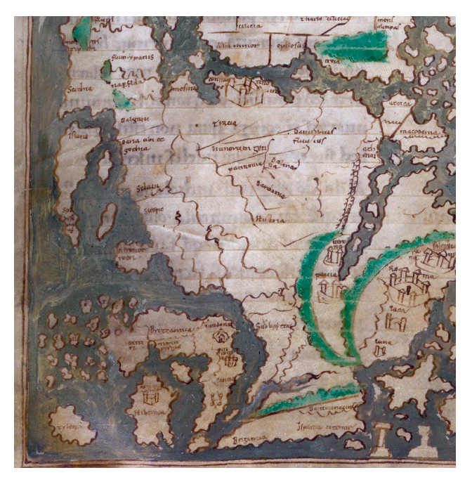
Fig. 6: Anglo-Saxon mappa mundi (detail), British Library Codex Tiberius B.V.1, folio 56v, 1025–50 AD, Canterbury? Topographical details are sparser on the continent of Europe.