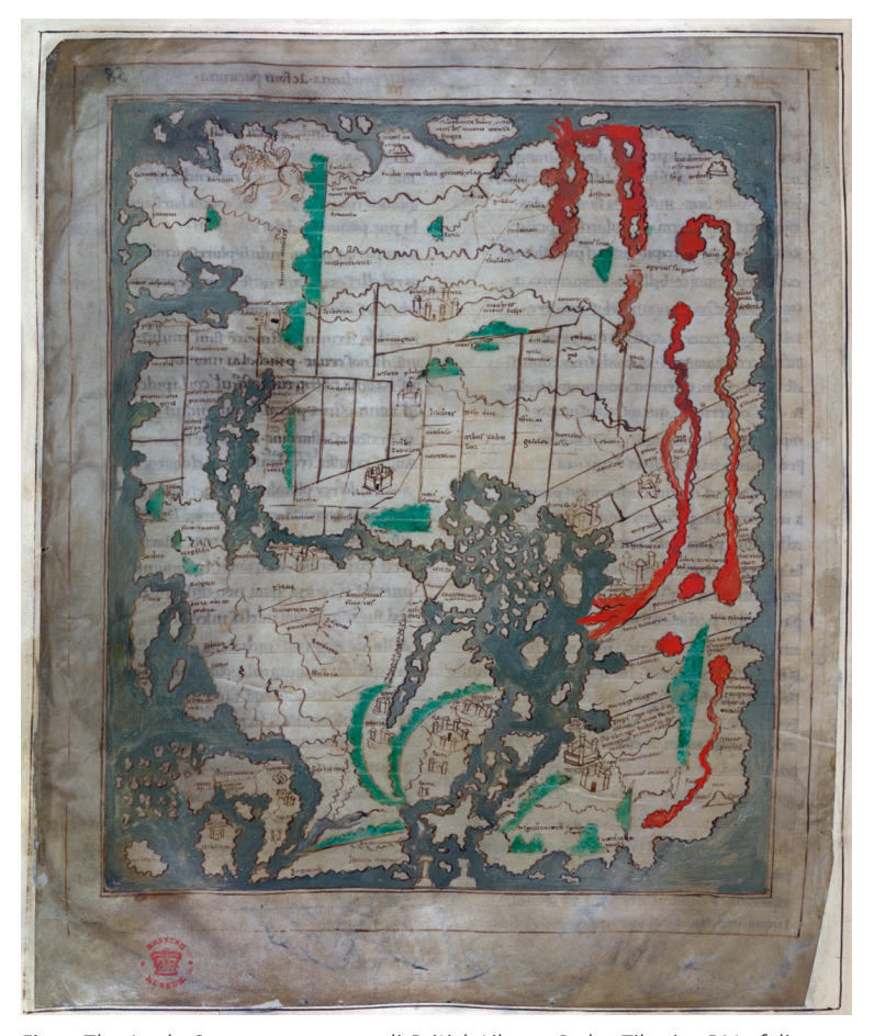
Fig. 2: The Anglo-Saxon mappa mundi , British Library Codex Tiberius B.V.1, folio 56v, c. 1025–1050 AD, Canterbury?, 21 × 17 cm.

On the Anglo-Saxon map, the spherical oecumene has been distorted by fitting it into a rectangular frame, which has also greatly reduced the depiction of the encircling Ocean. Mountains are shown in green, the Red Sea, the Persian Gulf, and the Nile are drawn in red, whilst cities are named and often sketched with symbols of fortresses or castles (fig. 2).<sup>18</sup>