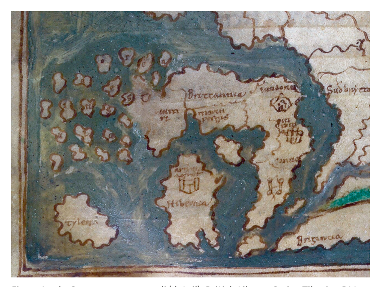
Fig. 5: Anglo-Saxon mappa mundi (detail), British Library Codex Tiberius B.V.1, folio 56v, 1025–50 AD, Canterbury?. Britannia is more accurately sketched and positioned closer to the continent of Europe.