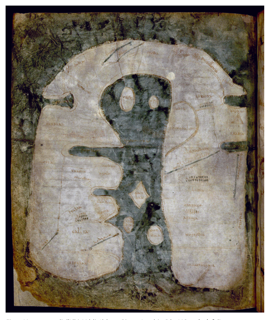
Fig 3: Mappa mundi d'Albi , Médiathèque Pierre-Amalric, Rés. MS 115 (29), folio 57v, 8th century, Spain/France. Britannia is situated as a circular island cut-off from Europe in the Ocean (bottom left).<sup>23</sup>