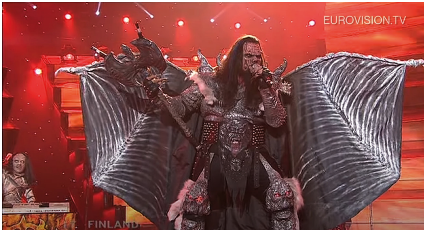
Fig. 1: Mr. Lordi at the ESC 2006, film still, 02:16. 19

Mr. Lordi sings these lines in a costume with huge bat-like extending wings (fig. 1). Especially during the last chorus pyrotechnical effects were used to underline the apocalyptic atmosphere. These lyrics declare Hard Rock to be a religion, coupled with an apocalyptic promise of salvation, the band's singer a messiah figure and the fans the believers who must decide between good and evil. The verses refer to religious symbols throughout, the matrix for this symbolism being a kind of common idea of Christianity (and not a specific community or denomination). The serious yet self-deprecating comparison of