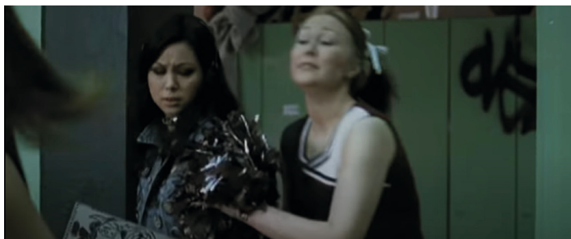
Fig. 2: The Hard Rock fan (left) is bullied by cheerleaders. Official music video clip of Hard Rock Hallelujah , 2006, film still, 00:31. 26