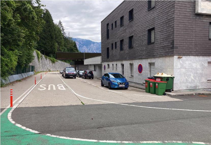
Fig. 3: The Austrian border infrastructure at the Thörl Maglern crossing.