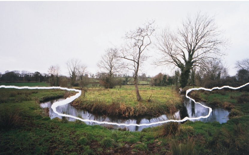
Fig. 7: Tristan Poyser, Invisible In-between . 42