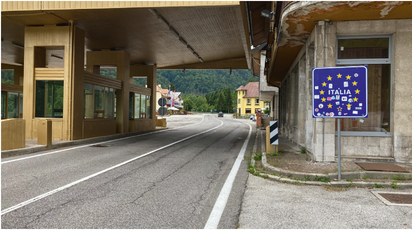
Fig. 5: View of Italy from the space between the Austrian and Italian border infrastructure at the Thörl Maglern crossing. The ITALIA country sign has been adorned with stickers by people crossing the border.

nationalist agenda (or that my primary school teacher had such an agenda), it serves as an example of how borders are imbued with symbolic meanings in a range of different contexts. It also serves as an example that the lines between a romanticised view of the past and an extreme right-wing nationalist agenda can be blurry and their discourses of borders can be fuelled by a range of sources.