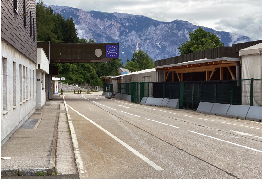
Fig. 2: View of Austria from the in-between space of the Austrian and Italian border infrastructure at the Thörl Maglern crossing.

B-road before the A2 Südautobahn connecting Tarvisio in Italy and Arnoldstein in Austria was built in the 1980s) in summer 2021 to take images, I was not the only person there.