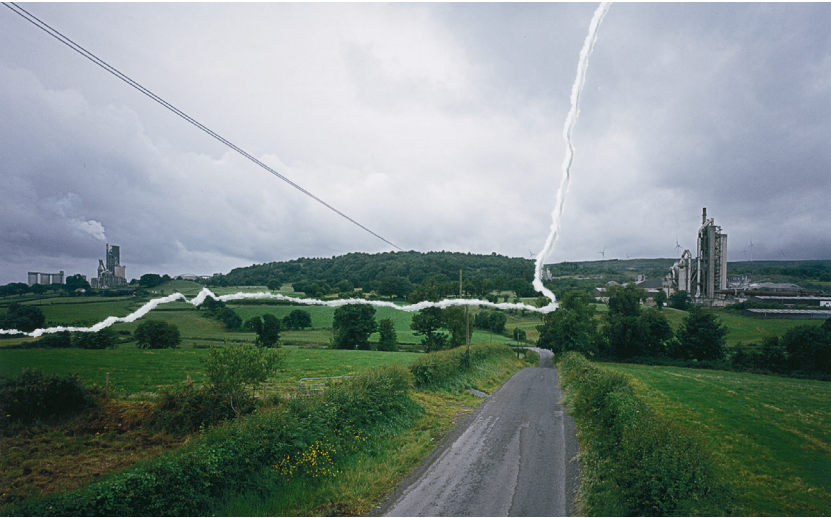
Fig. 6: Tristan Poyser, Invisible In-between . 41