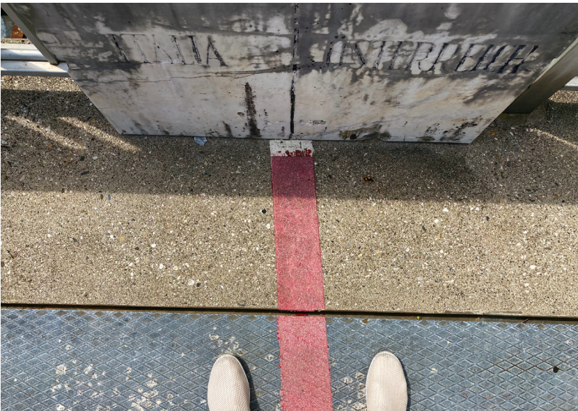
Fig. 4: Only after some searching in the in-between space made possible by the lack of border controls could I find the border line.