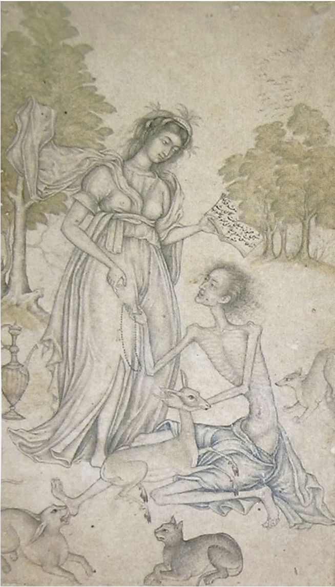
Fig. 5: Attributed to Manohar, Layla and Majnun , ca. 1595–1600, ca. 14.9 x 9.1 cm, detail of an album page from the Muraqqa-i Gulshan (Gulshan Album), Tehran, Gulistan Palace Library, no. 1663, p. 248. 51