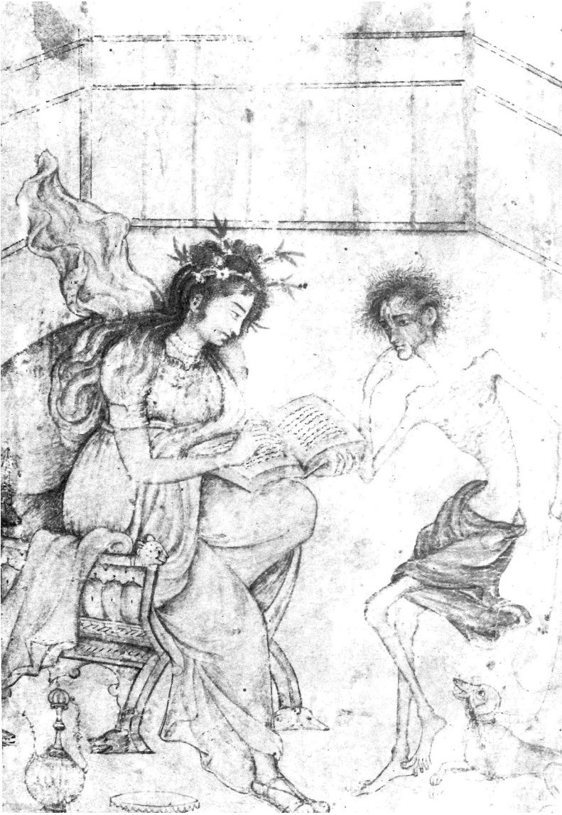
Fig. 6: Manohar, Majnun and Layla , c. 1605, 13 × 8.7 cm, formerly Paris, Ancienne collection Duffeuty and Galerie Jean Soustiel, location unknown, in: Soustiel 1986, 19.