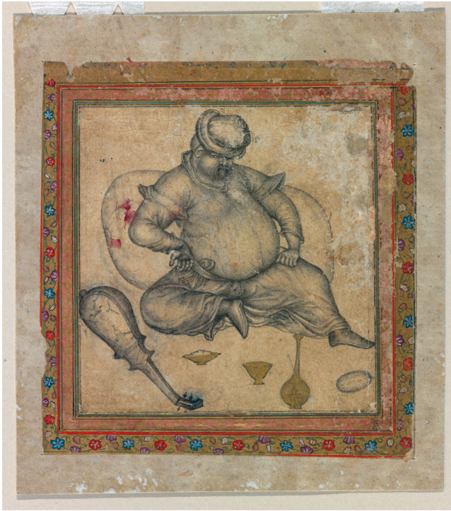
Fig. 3: Attributed to Basawan, Man in European Clothes , opaque watercolour and gold on paper, 8.5 × 8 cm, c. 1585, Washington, D. C., Freer Gallery of Art, Smithsonian Institution, F1953.60. 21