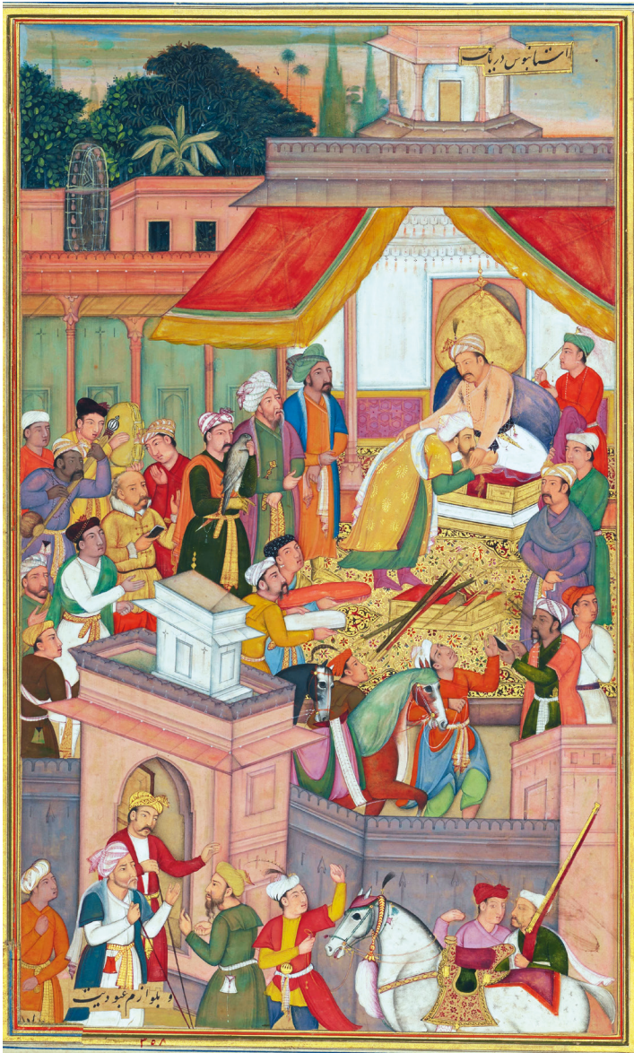
Fig. 1: Dharm Das, Akbar Receives Congratulations on the Birth of his Son Murad , Agra, June 1570, pigment and gold on paper, 45.4 × 27.2 cm, 1603–1605, Dublin, Chester Beatty Library, In 03.147. 10