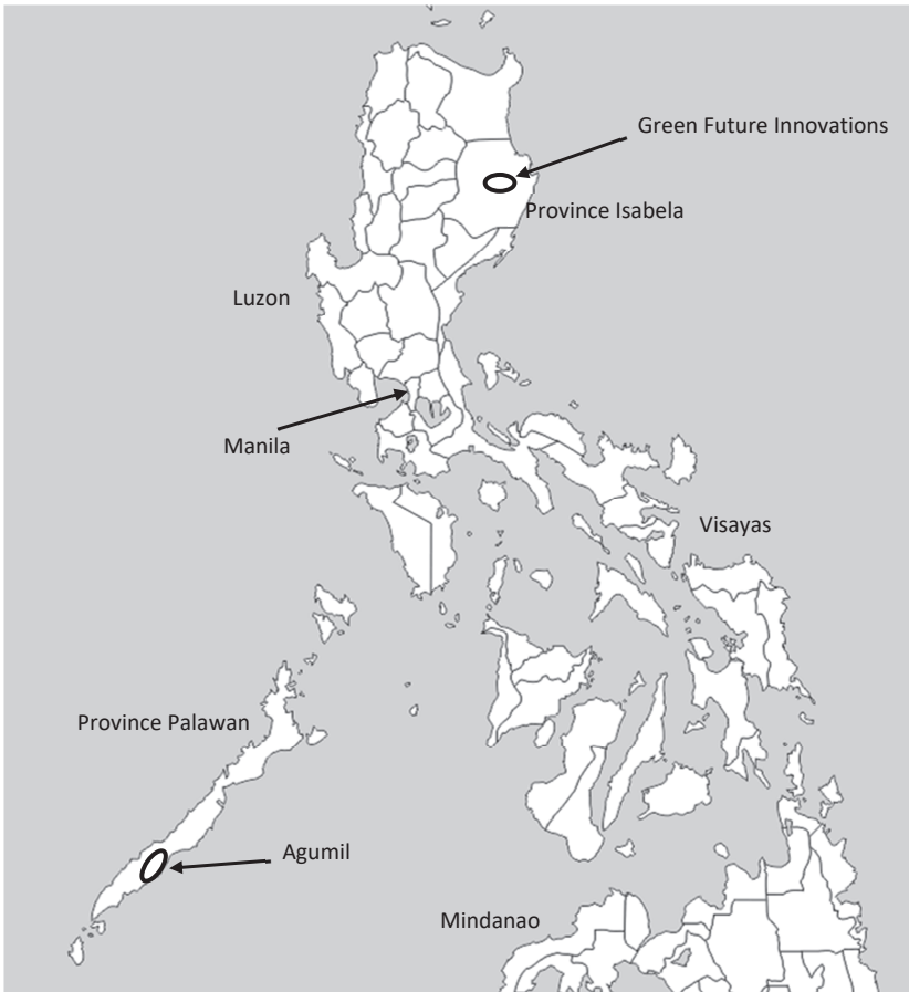
Figure 6 Map of the Philippines (Cutout)