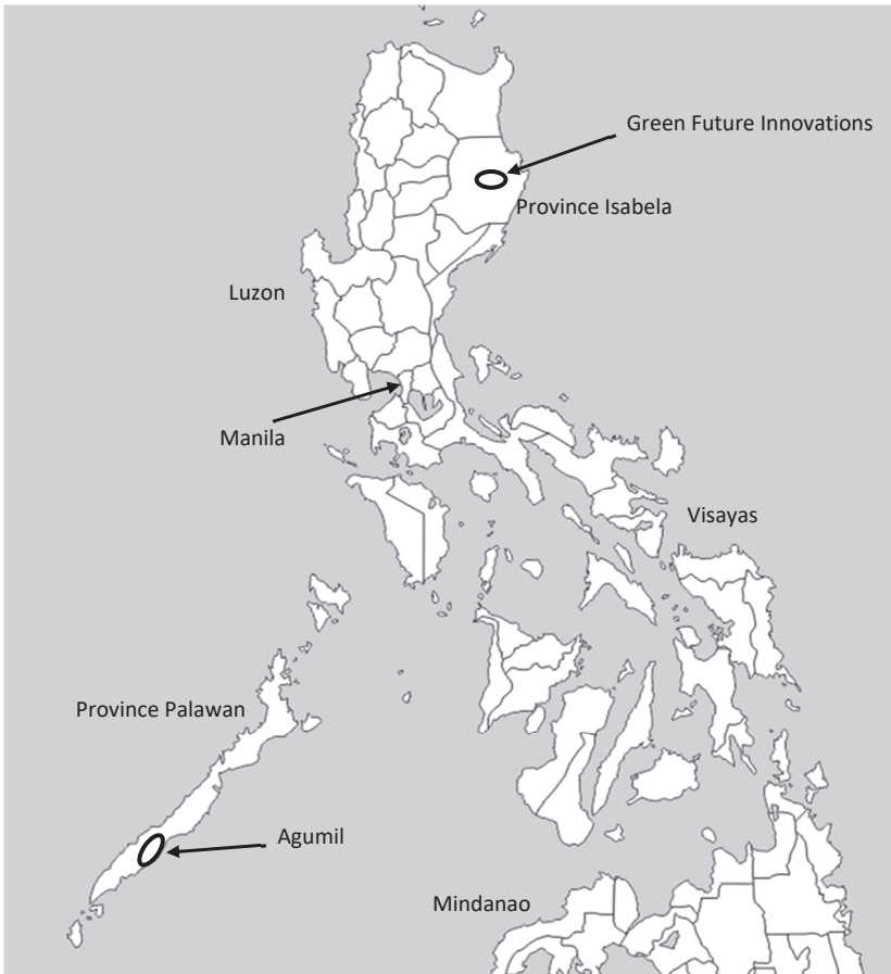
Figure 6 Map of the Philippines (Cutout)

(source of map: http://d-maps.com/carte.php?num_car=5600&clang=en , last visited 15/06/2018)