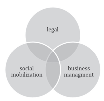
Figure 4 Three theoretical perspectives

All three perspectives make valid assumptions about the conditions under which local actors will be able to s pursue legal mobilization successfully. The legal perspective emphasizes the role of the legal opportunity structure. In contrast, a social mobilization perspective reminds us that local actors usually need some kind of support to access the LOS. The business management literature finally stresses the role of company characteristics, such as the corporate culture, in reacting to claims made by locals. I will integrate these three perspectives into one framework through discussing interactions and overlaps between the approaches using the lens of bargaining power.