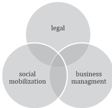
Figure 4 Three theoretical perspectives

All three perspectives make valid assumptions about the conditions under which local actors will be able to pursue legal mobilization successfully. The legal perspective emphasizes the role of the legal opportunity structure. In contrast, a social mobilization perspective reminds us that local actors usually need some kind of support to access the LOS. The business management literature finally stresses the role of company characteristics, such as the corporate culture, in reacting to claims made by locals. I will integrate these three perspectives into one framework through discussing interactions and overlaps between the approaches using the lens of bargaining power.